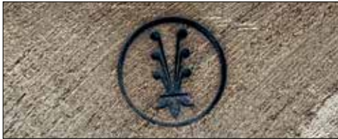
The Carcavelos Wood Seal

When one is very lucky, sometimes a very special piece of wood that has aged and matured, that has witnessed history and that has a story to tell, can become a magical ingredient as it captivates the guitar maker, fires his imagination and pushes him to go beyond the limits of his craft. It will resonate in the music imagined and played on the instruments carved from this wood, the Carcavelos Mahogany. This treasure was a stack of old disassembled wine barrels which had held a few thousand litres each. Mahogany, Vinhatico, Rosewood, seasoned for two and a half centuries.